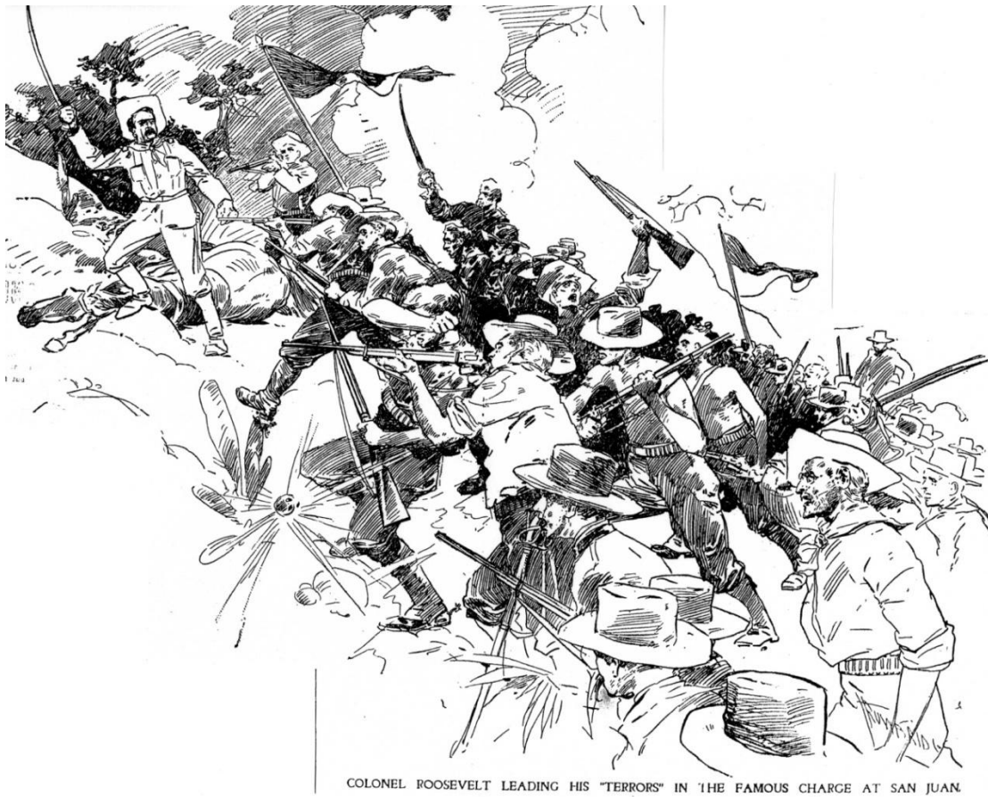
Fig. 2: Charleston News and Courier , July 24, 1898, 13.

essentially erased any southern need for the antebellum-style cavalier figure.