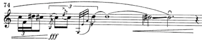
MONOLOG FOR BASSOON by Isang Yun © Copyright by 1983/84 by Bote & Bock Musik – Und Bühnenverlag GMBH & Co. Reprinted by permission of Boosey & Hawkes, Inc.

Pitch bending is another ornament, which recalls the flexible nature of traditional Korean instruments such as the piri , tai-keum and various non-fretted string instruments. Yun invokes traditional Korean music by using pitch bending as a way of coloring long-held pitches to keep them ever changing. Examples of bending pitch to rise and fall by a quartertone occur in measures 48, 50 and 51 (see example 6.9).