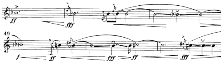
MONOLOG FOR BASSOON by Isang Yun © Copyright by 1983/84 by Bote & Bock Musik – Und Bühnenverlag GMBH & Co. Reprinted by permission of Boosey & Hawkes, Inc.

Yun also uses pitch bending in combination with other ornaments to produce increased dramatic effects. In measure 73 (see example 6.10), the simultaneous use of pitch bending and tremolo, along with written crescendos at the top of the dynamic range, heightens the dramatic effect Yun portrays in section five.