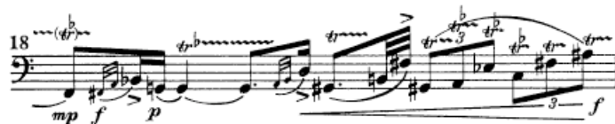
MONOLOG FOR BASSOON by Isang Yun © Copyright by 1983/84 by Bote & Bock Musik – Und Bühnenverlag GMBH & Co. Reprinted by permission of Boosey & Hawkes, Inc.

Yun often employs a rising portamento figure to conclude the hauptton at the end of a phrase. This type of figure has its origins in the music performed at the Korean court ritual Rite to Confucius, 145 and is particularly suited to traditional Korean instruments because of their flexibility of pitch. While in Western music the term “portamento” often refers to a vocal or string technique, Yun writes this ornamentation for Western wind instruments as well. The rising portamento figure is utilized at various points throughout the Monolog for bassoon . For example, in measure 36 Yun directs the hauptton D to rise a quartertone at the last sixteenth note of the bar (see Example 6.2, page 45). Yun also employs this figure in one of the many attempts in section five to reach the highly anticipated, but never achieved, high E (see example 6.8). The D#