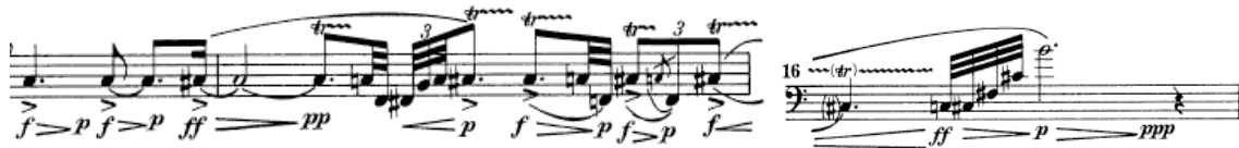
MONOLOG FOR BASSOON by Isang Yun © Copyright by 1983/84 by Bote & Bock Musik – Und Bühnenverlag GMBH & Co. Reprinted by permission of Boosey & Hawkes, Inc.

Trills can also provide texture among notes that serve other melodic functions surrounding the hauptton. In the last two beats of measure 18 (see example 6.7), Yun employs trills to embellish a melisma that rises from the G# hauptton.