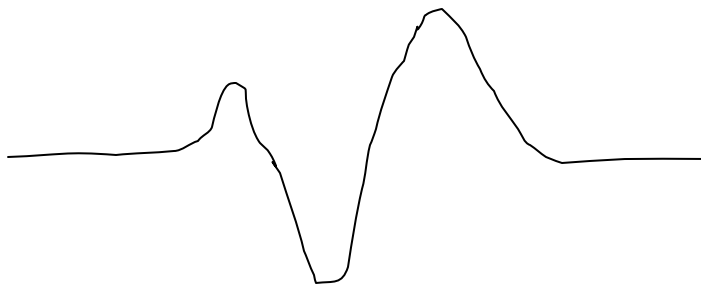
Figure 1. Different Types of Skin Potential Responses