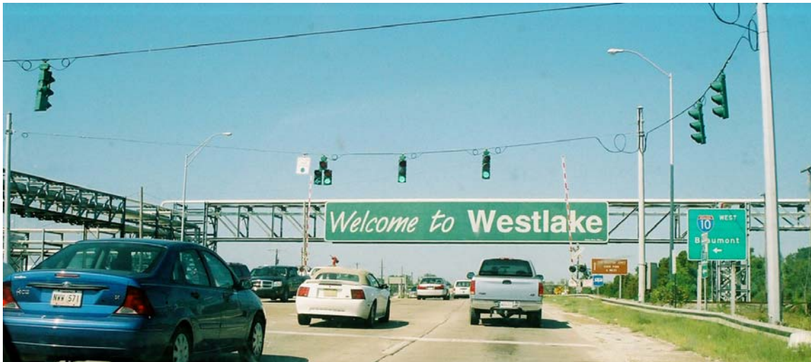
Entrance to Westlake

The first memories I have of the Lake Charles area are from early childhood. My father was born and raised in the area, and we would sometimes visit extended family there. Driving west along Interstate 10, we would pass through Lake Charles, cross the Calcasieu River, and continue west a few miles to Sulphur, where the family lived. At first glance, Lake Charles is not a very remarkable city; its appearance is not much different from any other small urban area. There are schools, slums, ranch houses, malls, a small university, and an airport. The city sits on a nearly circular lake, with man-made beaches and riverboat casinos lining the shores. However, what we saw on the west side of the lake always made me think twice about taking a swim. In Westlake (the community just across the river), the highway seems to run an industrial gauntlet. As we drove, towers, pipes, tanks, and flames surrounded us. The names came into view on tanks, trucks, rail cars, and road signs: PPG, Conoco, Citgo. The sign welcoming you to Westlake hangs from industrial pipes, suggesting the intimate bond this area has with industry.