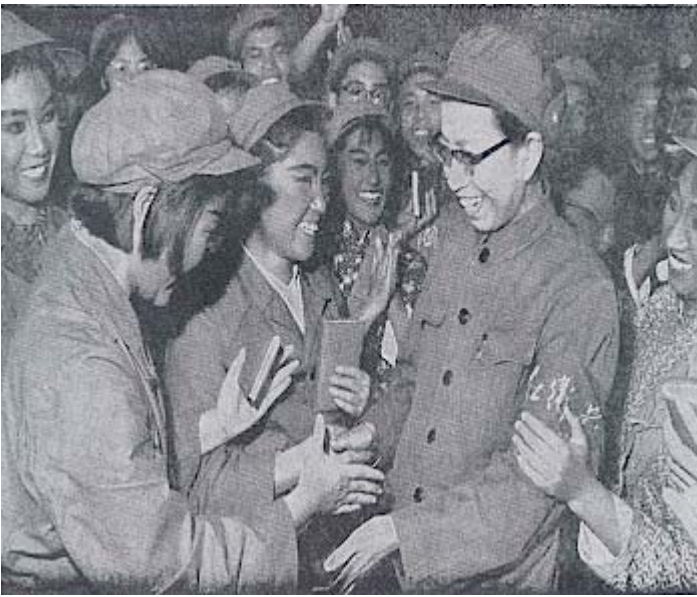
Figure 5: “Triumphs of Mao Tse-tung’s Thought in Literature and Art”, China Reconstructs , 1967 September, Page 9.

Red Lanterns, White Hair Woman, the Red Female Army, Harbors, Shajiabang, and Praise of Longjiang. The themes were the same: how Chinese women fight against the old system and enemy and how brave and fierce they were. For example, the Red Female Army told a story about how females oppressed by the old landlord got awaked and took up guns to fight against their enemy and got the victory. It went without saying that these female soldiers wore military green, which were also “Mao green”.