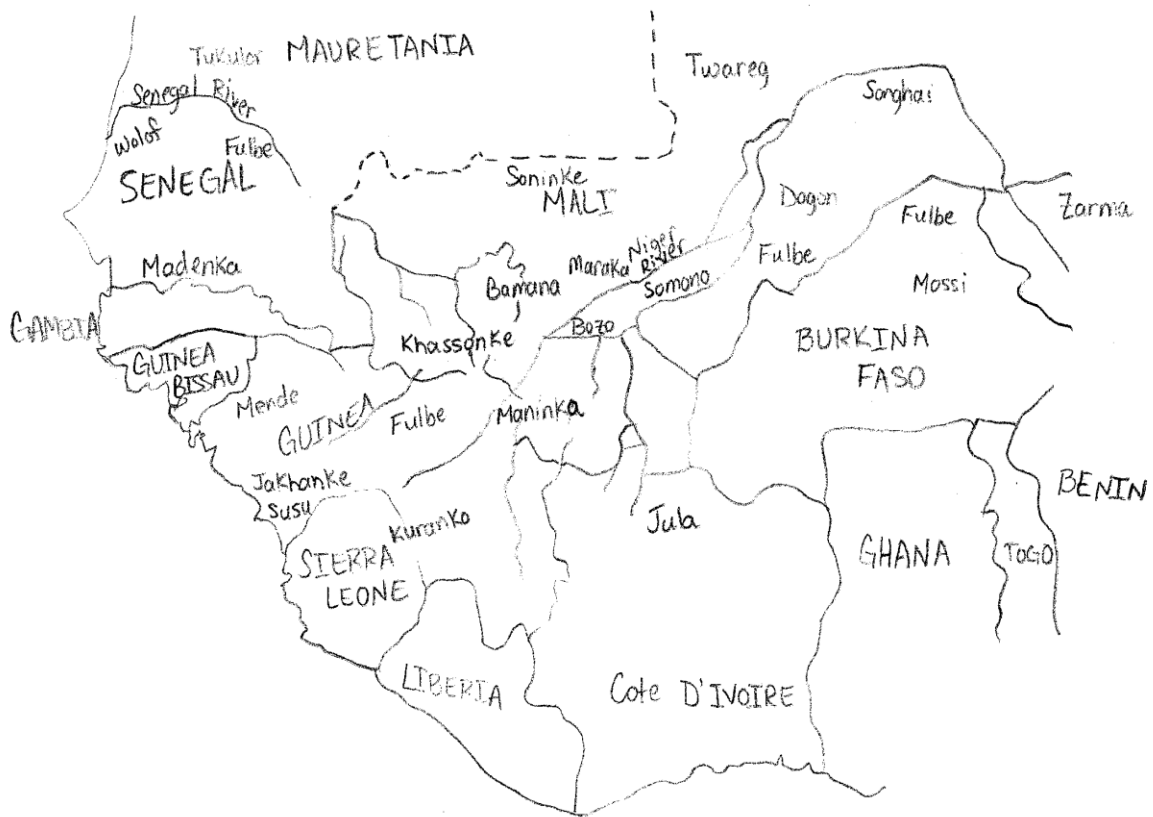
Figure 3. Map of Mande ethnic groups and modern political boundaries of West Africa (identified by all capital letters). Adapted from Austen (2000).

deeds overcome this status to create an even more accomplished reputation for future generations to strive to surpass (Bird and Kendall 1980:14-15). This practice encourages the strengthening of the whole of society through individual efforts of self-promotion.