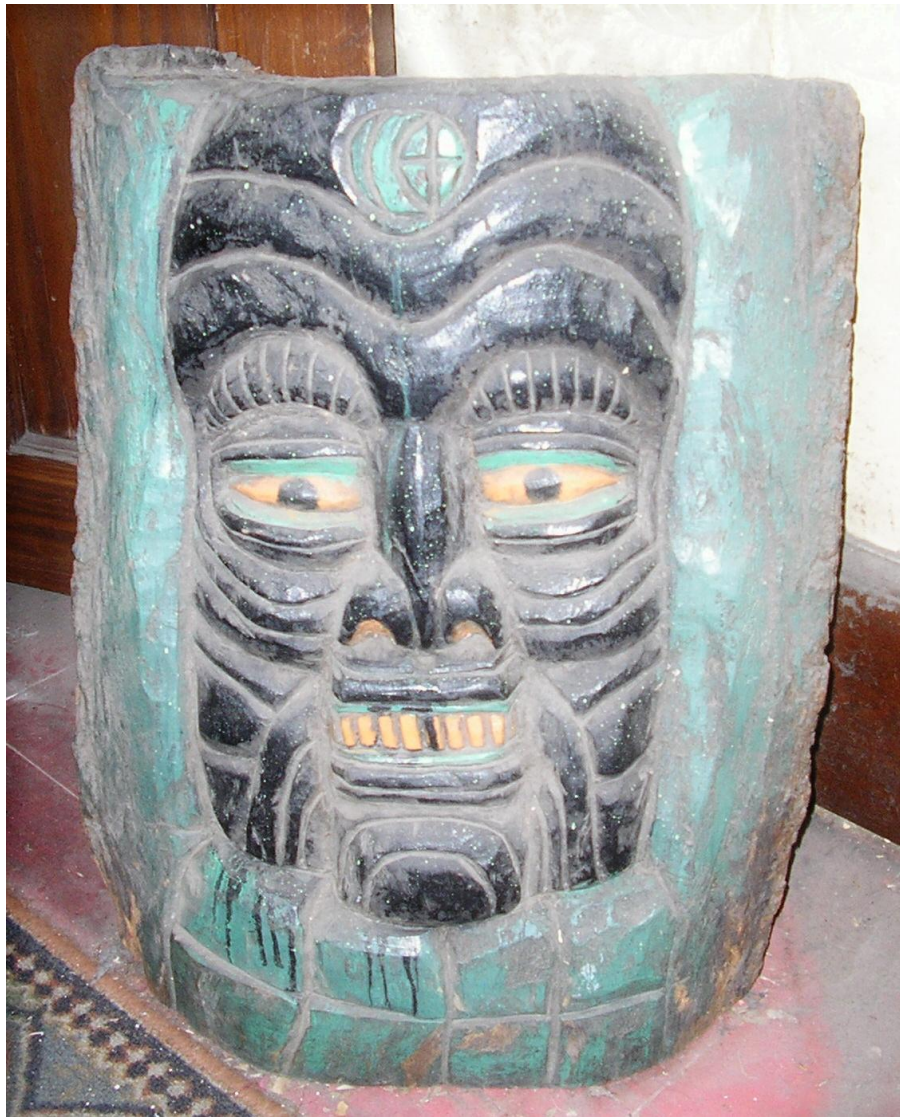
Figure 4: Artistic representation of a warning stump (artist Herbert Singleton). Photo taken by author, February 27, 2008.

with the legacy of San Maló. This has led me to believe that the knowledge of such a figure is confined to those who were brought up in the New Orleans community and is kept secret from all outsiders, whether part of the Voodoo community or not. When questioned about any relationship which may exist between San Maló and Saint Raymond she did not acknowledge any such connection but pointed out the various Saint Raymond figures present in the temple. Although there were many individual African Saint figures throughout the temple she could not point out any that were specifically identified as Saint Maló. There is the possibility that I just