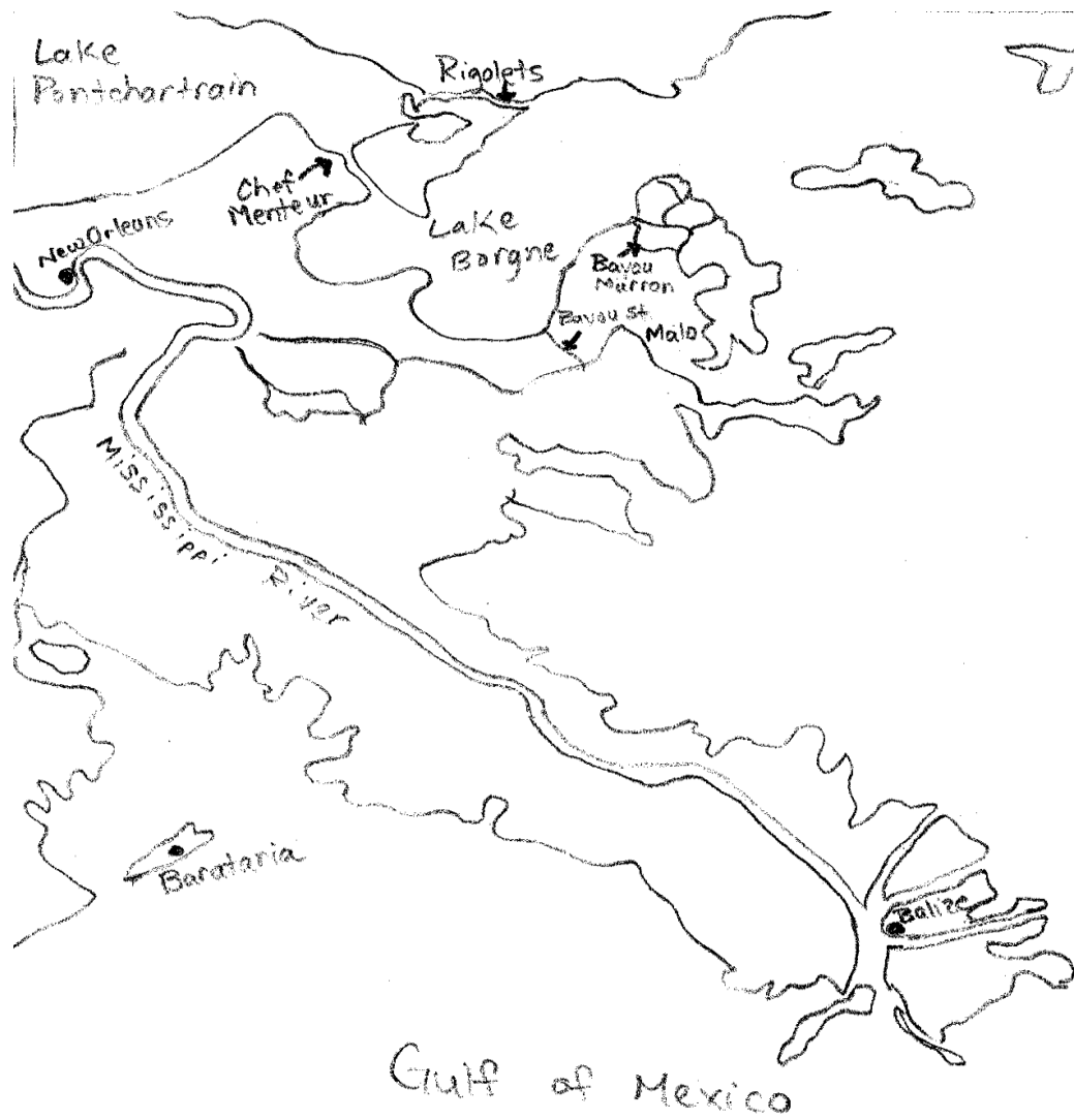
Figure 2. Location of San Maló Maroon Communities, 1780s. Adapted from Hall 1992:212. This map shows the areas that Saint Maló's band controlled. The places of interest pointed out in this map are Chef Menteur, the Rigolets between Lake Pontchartrain and Lake Borgne, the eastern shore of Lake Borgne where Bayou St. Malo and Bayou Marron are denoted, and the Baratania Islands where the remnants of Saint Maló's band fled after his capture and execution. The location of Ville Gaillarde is in the southeastern area between New Orleans and the Eastern shore of Lake Borgne (Hall 1992:212).

information on what the maroon experience was in the contiguous United States. More information on all of these maroon societies can be found in: Deagan and Landers (1999), Flory (1979), Landers (1990), Mulroy (1993), Price (1979), Schwartz (1992), and Weik (1997).