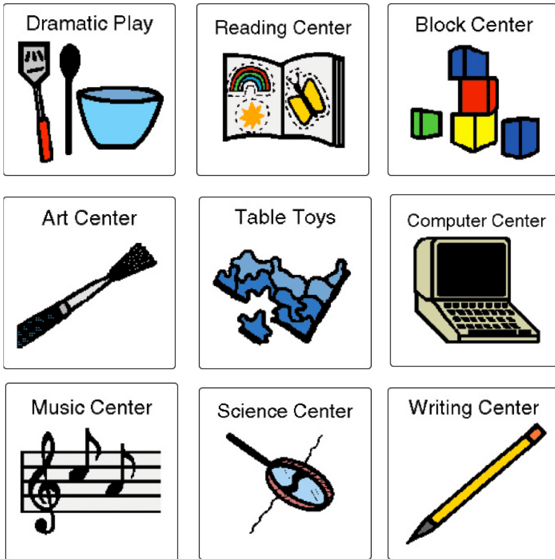
Figure 2: Boardmaker™ symbols used on choice boards.