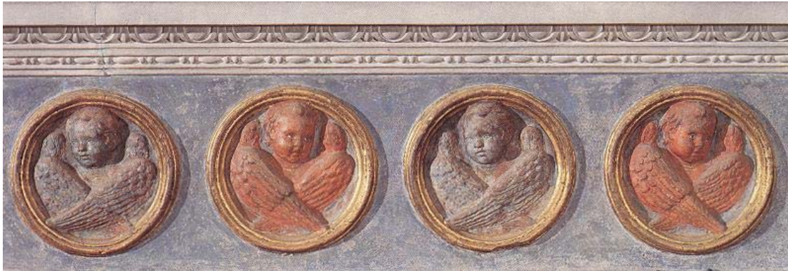
Fig. N. Donatello, Seraphim and Cherubim , frieze, Old Sacristy

addition does enhance the experience of the room for the viewer and aids in emphasizing the geometrical elements featured in the coats of arms.