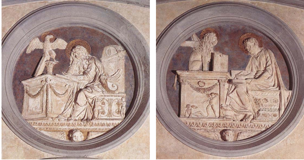
Fig. M-2, Donatello's lunette tondi continued, Old Sacristy, (left) Evangelist John , (right) Evangelist Mark .