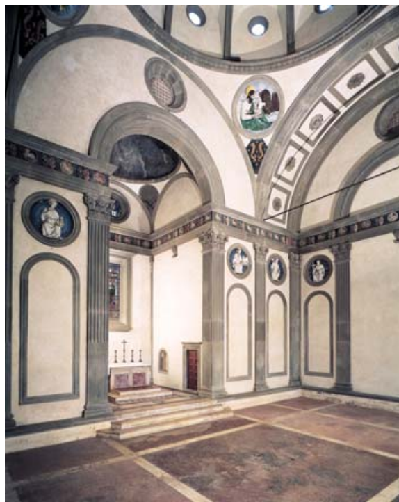
Fig. F, Brunelleschi (?), Pazzi Chapel , Santa Croce, Florence, 1441-1460.

Here, Brunelleschi employed four roundels in the pendentive spaces in the corners of the chapel, similar to those I will describe in the Old Sacristy. These chapels were constructed as memorial chapels, much like the Old Sacristy, in order to display members of the families prominently, even after their deaths. The Pazzi financed the chapel that bears their name to serve as the chapter room for the Franciscans of Santa Croce around 1441-1460. Although constructed after the Old Sacristy, it is strikingly similar in design; widely thought to have been designed by Brunelleschi himself, at least in part, it was likely constructed by Michelozzo. 29