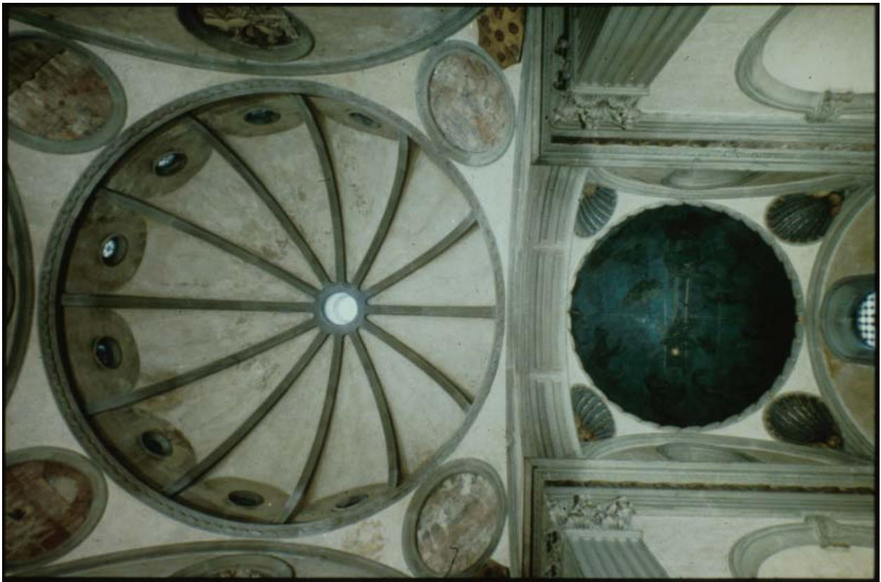
Fig. I, The large and small domes of the Old Sacristy

The format used by Brunelleschi in creating the large 12-sided central umbrella dome had several of the influences that may have contributed to its design. A Roman influence can be