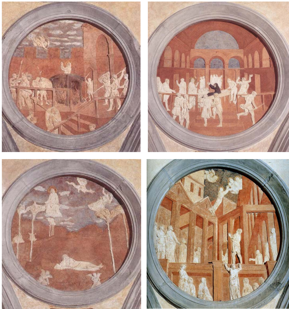
Fig. L, Donatello's pendentive tondi, Old Sacristy, (top left) Raising of Drusiana , (top right) Martyrdom of St. John , (bottom left) St. John on Patmos , (bottom right) Ascension of St. John .

The lunette tondi, located just below the arches in the main sacristy, feature portraits of the four Evangelists while the pendentive tondi, which rest just above the Medici coats of arms in the four corner pendentives, feature four scenes from the life of St. John the Evangelist. 73