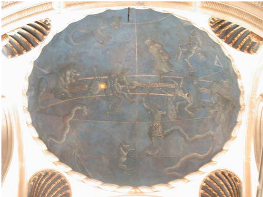
Fig. J, The painted dome in the choir of the Old Sacristy

astrological ornamentation. 46 I believe it is important to see that Cosimo understood that this astrological theme was related to Christianity. In his cell at the Convent of San Marco, a fresco of the Adoration of the Magi by Fra Angelico and Benozzo Gozzoli includes a man holding an astrological instrument. 47 Although astrology played an important role in Cosimo's life, it did not detract from his faith in Christianity, but enhanced it, and need not to be looked at as pagan, but simply classical.