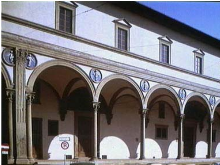
Fig. Q, Brunelleschi, Hospital of the Innocents , Florence, 1419-1427

roundels seem to fit just inside the molding of the arches and the dome above, making them appear to have a supporting function for the dome. This is reminiscent of what we see in the Old Sacristy. In all three cases, ornamentation is restrained and controlled by the structural logic of the buildings.