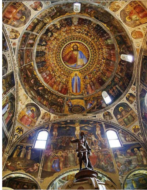
Fig. G, Paduan Baptistery , 11 th century.

When studying the design for Brunelleschi's sacristy, it is obvious that he had visited the baptistery in Padua or was at least aware of its layout prior to the Old Sacristy's construction. Could it be that Brunelleschi was so inspired by the building that he designed the Old Sacristy to be a critique of the baptistery in Padua in terms of its ornamentation? The frescos that adorn the walls of the Paduan baptistery were created by Giusto de' Menabuoi between 1376 and 1378. The Old Sacristy, begun nearly 40 years later, was, in its original design by Brunelleschi, to have very little in terms of ornamentation, be it sculpture or fresco. I believe that upon seeing the Paduan Baptistery, Brunelleschi was enamored with the architecture but distracted from its inherent beauty because of the frescos. The features such as the pendentives, dome, and arches had such a classical beauty that Brunelleschi felt they could stand alone without the interruption of additional elements of ornament or frescos and decided to incorporate those elements into the Old Sacristy. Each structure also utilizes the massing of volumes in similar ways, vertically—geometric entity upon geometric entity—creating another visual parallel between the two spaces.