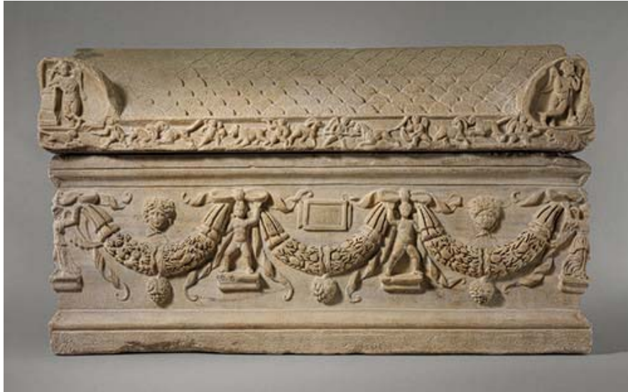
Fig. D, Roman Sarcophagus, third century, marble

change of style from that of his earlier pair of northern doors of the same building.” 24 He employed the new, lower relief style of the time, which did not allow him to utilize nature in the round; therefore he was unable to cast natural elements to complete his sculptural work. It is noteworthy that Ghiberti was beginning to render the natural elements in a more stylized manner instead of making them exact replicas of the nature they were intended to represent.