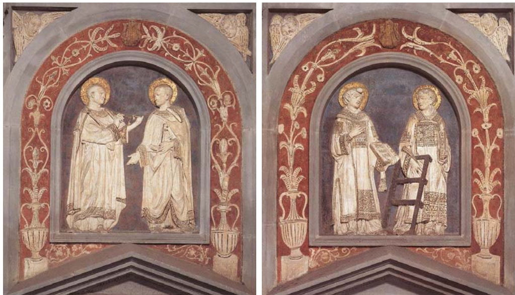
Fig. P, Donatello, (left) St. Stephen and Lawrence , and (right) St. Cosmas and Damian , located above the bronze doors, Old Sacristy

creating his doors for the sacristy of the Florentine Cathedral (1442-1475), both of which contain saints and martyrs. 85 It is possible, then, that because the subject was in vogue at the time of the doors' creation, Cosimo would have asked Donatello for something similar. By doing so, he compromised Brunelleschi's original idea of an unornamented sacristy, but, as we shall see, he also set the stage for greater compromises to come.