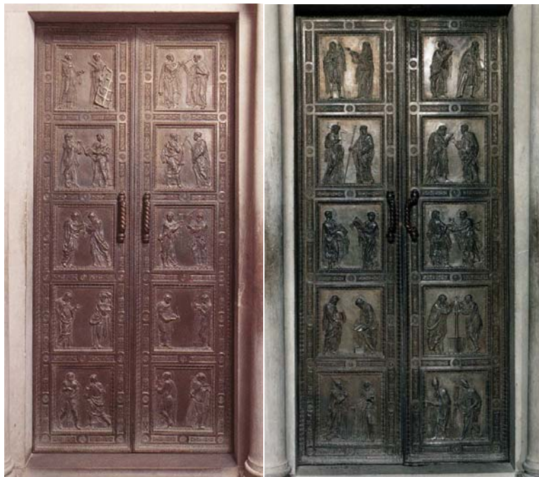
Fig. O, Donatello, (left) Door of the Martyrs , (right) Door of the Apostles , Old Sacristy

figures of the individual panels as ‘fencers’ ( schermidori ), and Manetti, in his life of Brunelleschi, castigated them and their heavy surrounding aedicules for having ruined the pristine clarity of Brunelleschi's architecture.” 75 These responses show two different alleged flaws with the doors. Filarete refers to the sculpted figures in the panels, which feature forty apostles and doctors of the church spread over twenty panels, as “fencers,” most likely because each individual panel holds two characters standing opposite and sometimes gesticulating toward each other. Each character is basically upright, either facing or in some cases turning away from the other character in the panel, with whom he is interacting. The compositions are nearly the same in every panel, making the characters seem similar from a distance. Only upon close inspection can one make out who the figures represent based on what they are holding or wearing, or some other identifying feature.