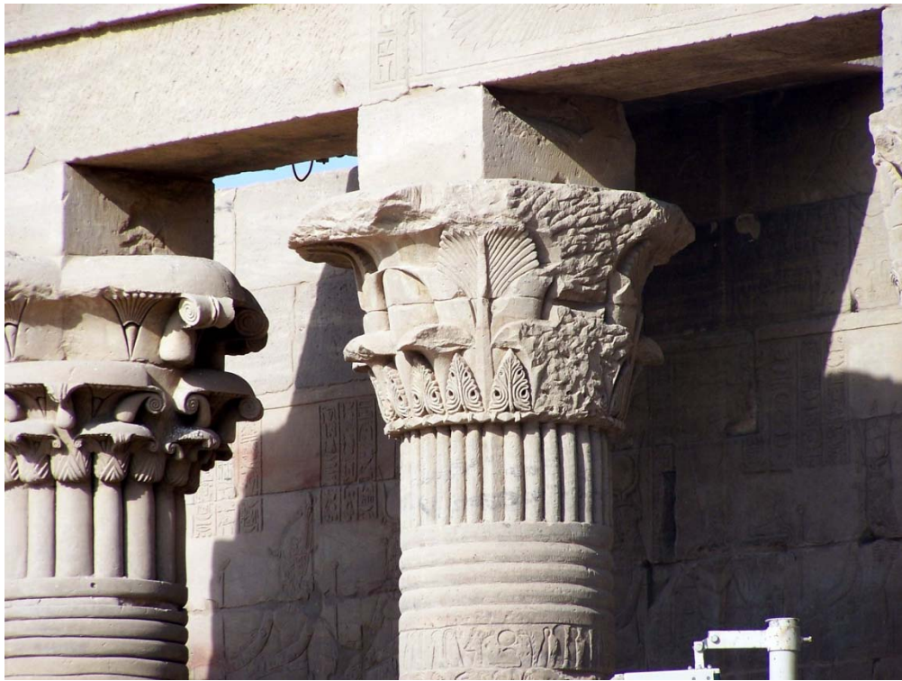
Fig. A, Egyptian lotus flower capitals

essential to understanding how and why it was utilized during the Early Renaissance and why Brunelleschi chose to eliminate a great deal of it from his architecture. A paradigmatic early example is the lotus flower, which is a natural element often seen in hieroglyphics. In Egyptian mythology the lotus flower was a symbol referencing the sun, creation, life and death. 7