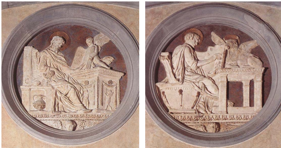
Fig. M-1, Donatello's lunette tondi, Old Sacristy, (left) Evangelist Matthew , (right) Evangelist Luke .

The two types of tondi in the Old Sacristy, those of the lunette and pendentives, have two very different functions. The original placement of the unsculpted roundels in the pendentives served an architectural function that bound the arches on the sides of the pendentives to the dome above. The lunette tondi, which were added later by Cosimo, serve no real architectural function other than to fill in a space that would otherwise have been an empty section beneath an outlined arch. Because these tondi had no architectural integrity, it is not surprising that Brunelleschi would have been unhappy with their placement.