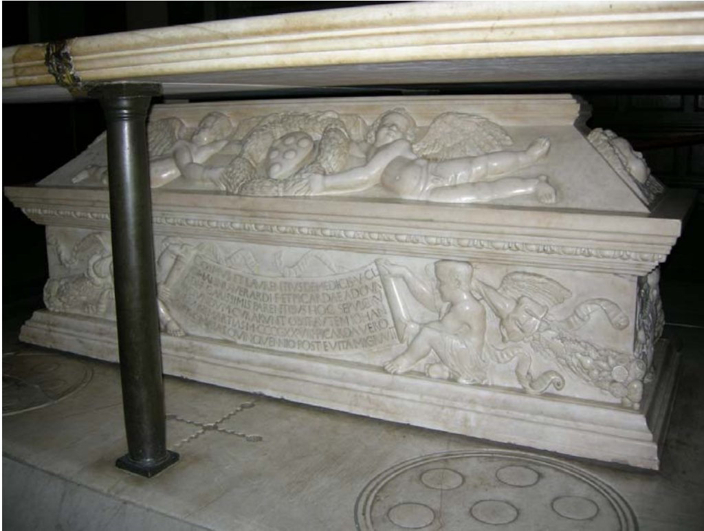
Fig. K, Buggiano, Tomb of Giovanni di Bicci de' Medici , Old Sacristy

possible that Giovanni did not want such an elaborate tomb, but possibly just a modest stone on the floor of the sacristy marking his place of burial. 53 Certainly such a tomb would have coincided more appropriately with the overall sense of space and with the limited architectural ornamentation that Brunelleschi envisioned, rather than the elaborate tomb that in which Giovanni now rests.