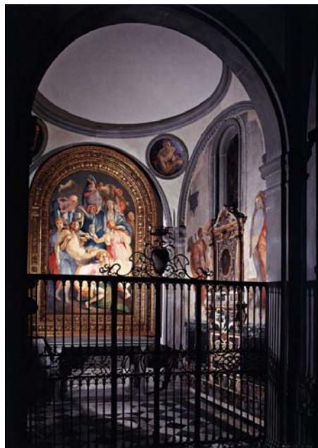
Fig. E, Brunelleschi, Barbadori Chapel , Santa Felicita, Florence, 1419.