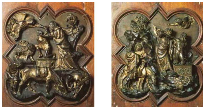
Fig. C, (left) Filippo Brunelleschi, Sacrifice of Isaac , (right) Lorenzo Ghiberti, Sacrifice of Isaac , created for the door competition of the Florence Baptistery.