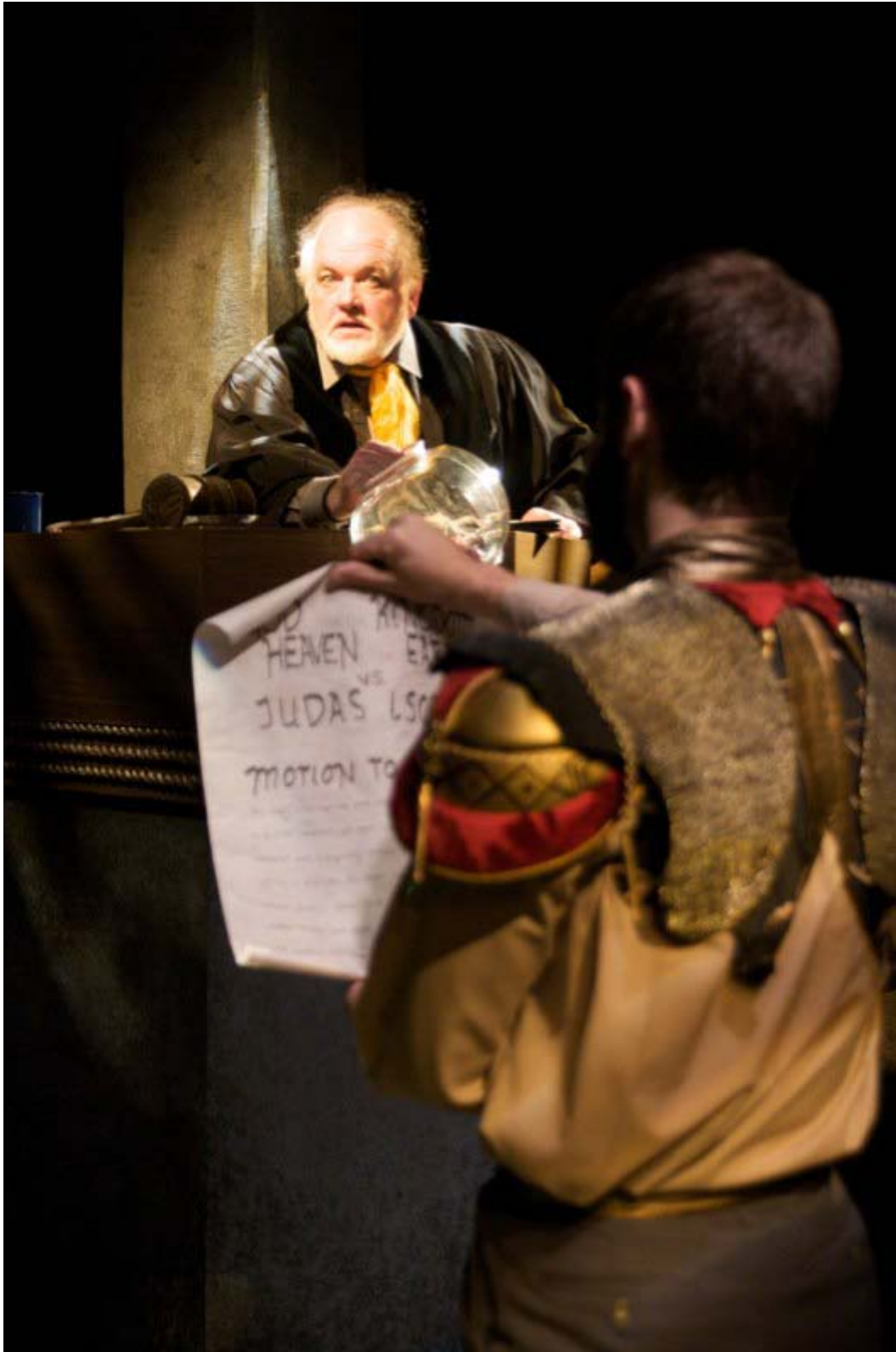
Above: Judge and Bailiff