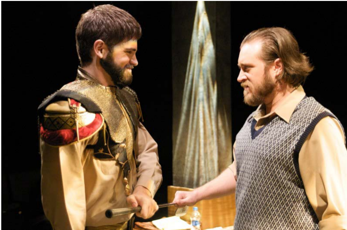
Above: Bailiff and Pontius Pilate