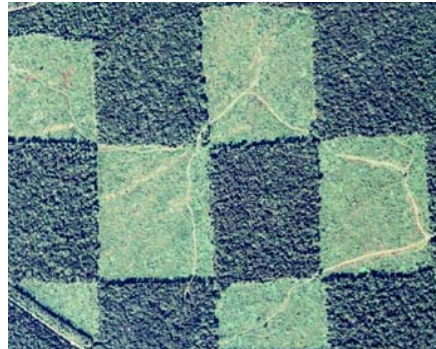
Figure 2. Aerial photograph of a common 16 ha clearcutting pattern used to manage forests in a bottomland forest of West Baton Rouge Parish.

plant communities. The close juxtaposition of mature forest providing mast during fall and winter with early successional habitats replete with high quality browse and cover likely allows deer to maintain smaller home ranges than one would expect based on an examination of literature detailing space use of deer in southern latitudes.