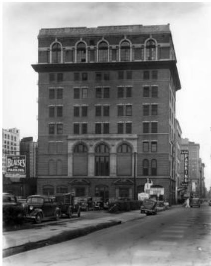
Figure 4. Pythian Temple Building

The newspaper's first office was located in the black owned Pythian Temple building at the corner of Gravier and Saratoga (now Loyola Ave.) Streets. The Pythian Temple building, the only black owned building of its size was home to many of the civic and social organizations in New Orleans. It allowed members of the black community to organize and congregate in an atmosphere free from white involvement. These organizations often shaped issues in the black community providing the Louisiana Weekly with easy access to report on agendas and platforms.