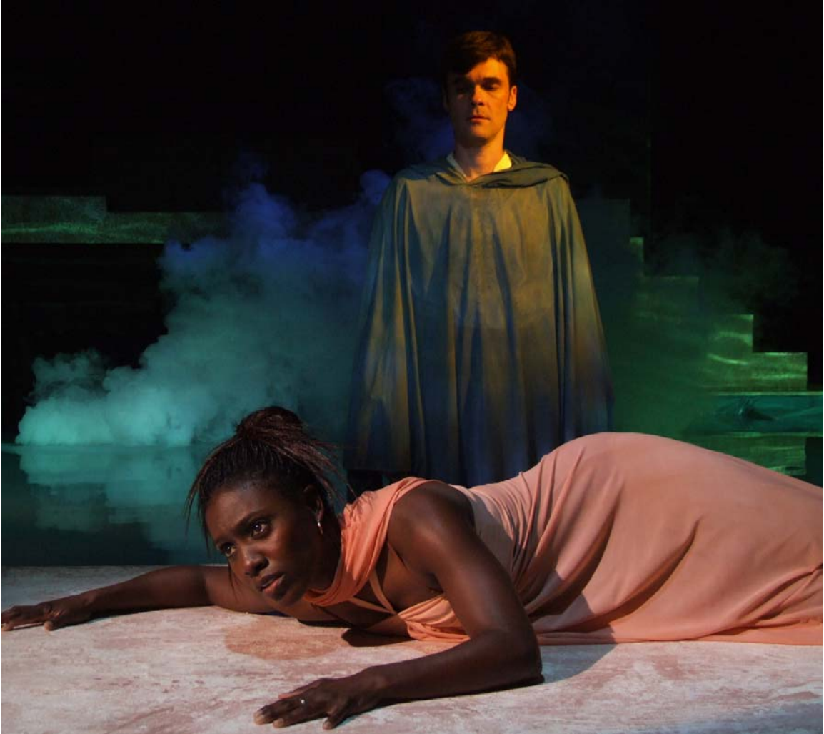
Production Photo: Morpheus-as-Ceyx and Alcyone