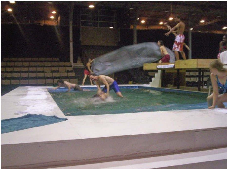
In rehearsal: The attack on Ceyx's ship