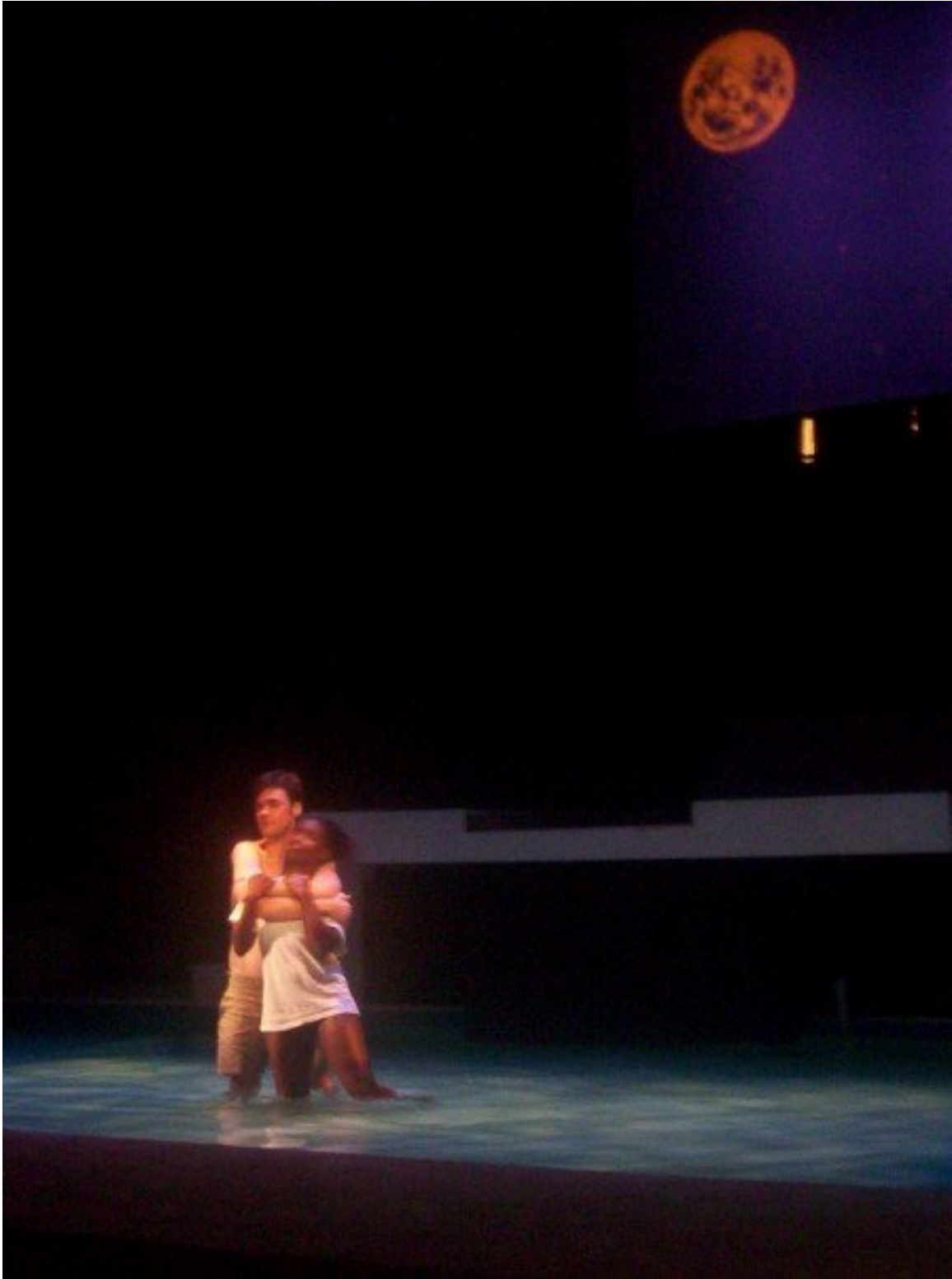
In rehearsal: Ceyx and Alcyone