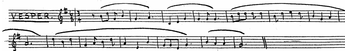
Example 4. Sowande, Yoruba Hymn Tune in Vesper .