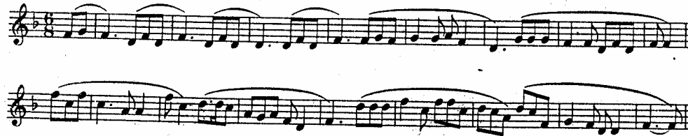
Example 1. Sowande, Indigenous Folk Melody in Yoruba Lament .

Yoruba church tune on the Ten Commandments. See Example 1 for the theme of Yoruba Lament and Example 2 for the theme of Kyrie .