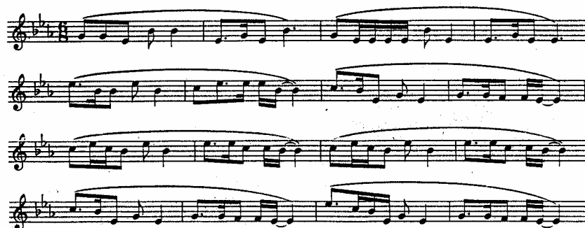
Example 3. Sowande, Yoruba Hymn Tune in Prayer .

Ransome-Kuti titled “Gloria.” Example 3, illustrates the borrowed melody in Prayer .