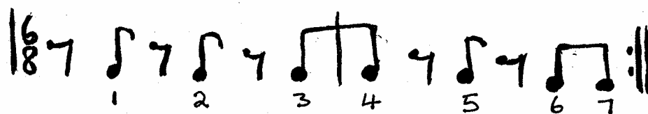
Example 6. Original Version of the Yoruba Konkonkolo Rhythm.

Yoruba refers to it as konkonkolo because, “with his propensity for translating percussive rhythms into words through his drums, the drummer says that the small drum in the Yoruba Drum Orchestra which beats out this rhythm regularly, and serves virtually as the ‘metronome’ of the orchestra, is in fact saying konkonkolo, konkolo .” 43 Example 6 provides the original version of the Yoruba konkonkolo rhythm, while Example 7, illustrates the variant of the konkonkolo rhythm and polyrhythmic construct in Sowande’s Laudamus Te .