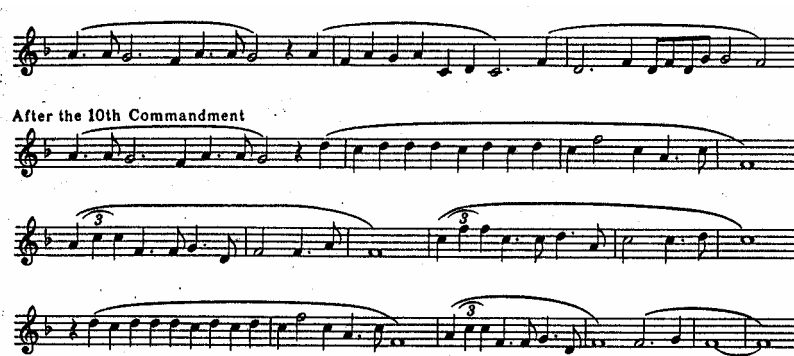
Example 2. Sowande, Yoruba Church Tune in Kyrie .